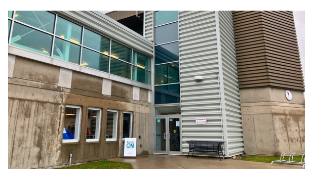
EarlyON at Stratford YMCA 204 Downie St, Stratford